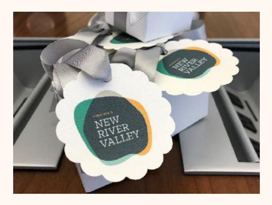
VEDP MARKETING TRIP - Richmond, VA